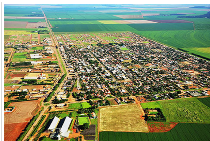
Despite its enormous size, totalling more land mass than France and Germany put together, Mato Grosso state only has a population of just over three million people

With a degree in physical education and postgraduate in teaching in higher education, Cleiton considers chess a great educational tool as it contributes to develop student concentration. Among the good results of the project, he cites performance improvement, such as better average grades among students who play the game compared to the others.